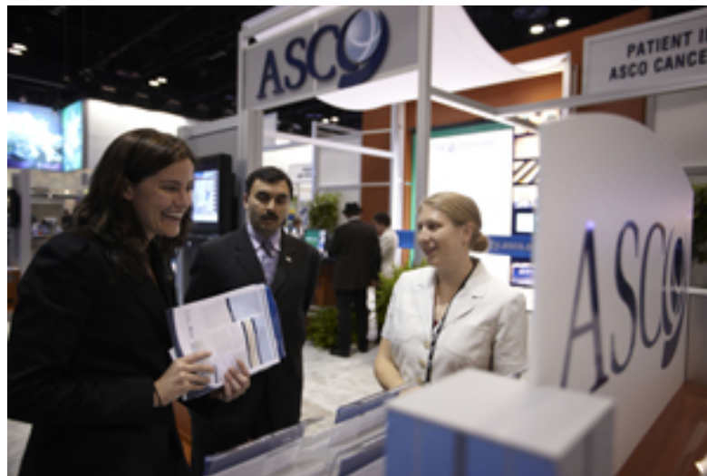
Attendees visit the ASCO Patient Information Booth at the 2009 Annual Meeting